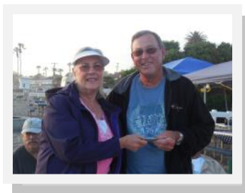
Fisherman of the Week