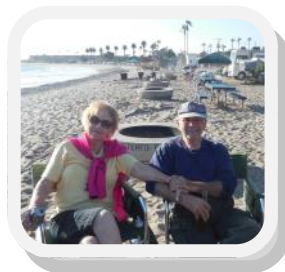
A Relaxing Afternoon