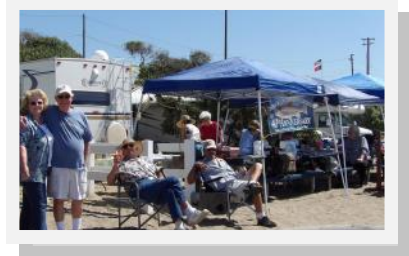
The Gathering Place