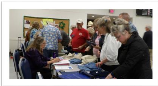
Checking out the new line of apparel.