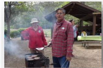
Cooking up those dogs and burgers.