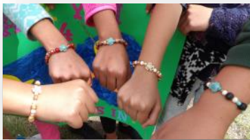
Each child got a bracelet made by the ladies at San Onofre.