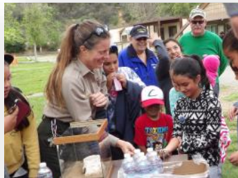
The tarantula! Would you do this??