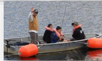
The kids loved going out on the boat.