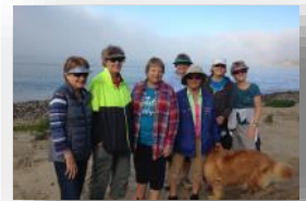
The walkers, after watching a pod of dolphins swim by.