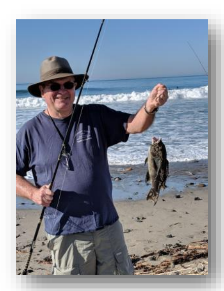
Tony's Sheepshead; winning fish.