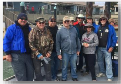
The Dana Point Group