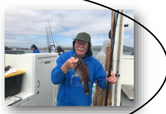
The Winner's Circle