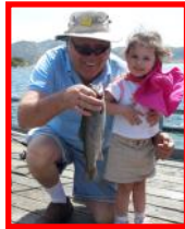
Some Kiddie Pond Alumni

Volunteers are still needed for the Kiwanis /City of Escondido Fishing Derby. There has been a good turn out, but we can do better! A couple of reasonably handy guys would make the setup go smoother on Monday April 18, from 3 pm to 5 pm. We are thin on some spots for the Derby and Kiddie Pond on April 23 and 24. There is a minimum number of volunteers needed for the entire weekend, but there are never too many! This is a fun event, and a good chance to see many of your Senior Angler fishing buddies.