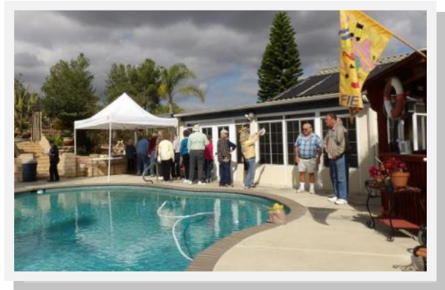
A beautiful Day