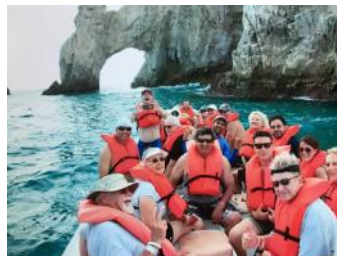
So much fun!!!!