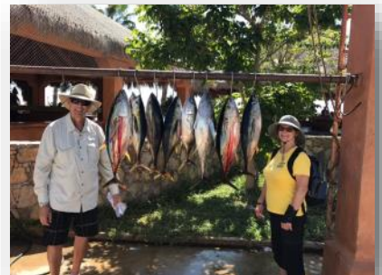
Limits of Yellowfin