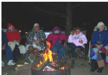
A little chilly?