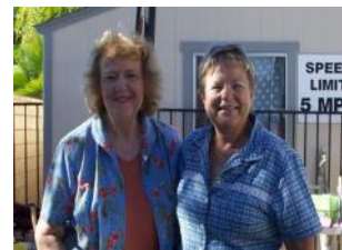
The Silent Auction Ladies