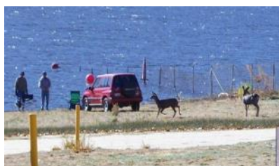
The fishermen have visitors.