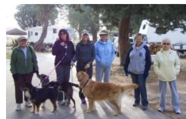
The walkers out for their morning stroll.