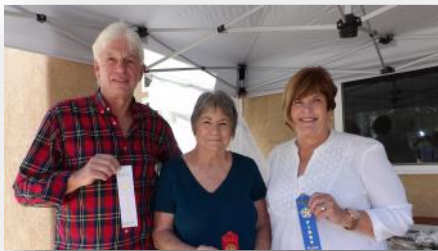
Winners of the Pumpkin Dessert Contest

Thanks to all who contributed food, items for the white elephant sale and helped out in so many ways to make this event a big success.