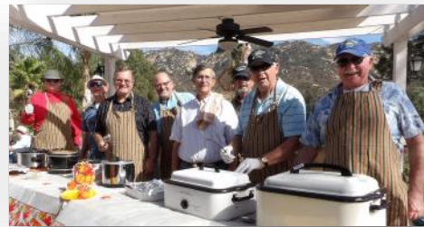
The men of the BOD served dinner.