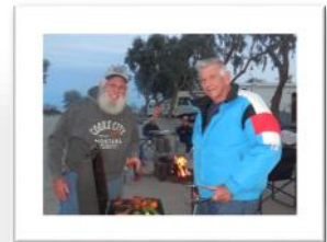
Bar B Que Night