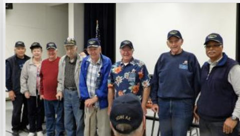
We honor and thank our Past Presidents