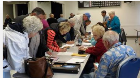
The sign-up tables were pretty busy. So much to do.....