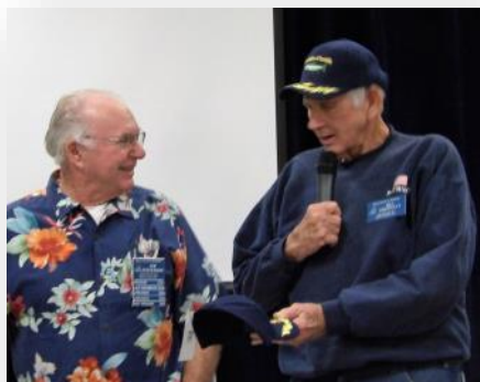
The presentation of the President's Hat