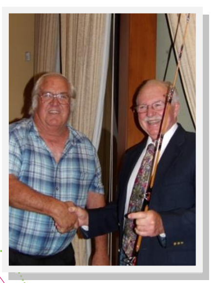
Our President wins the Fishing Rod Raffle .....