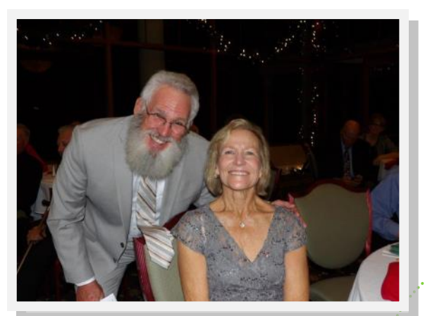
Our MC and his first lady