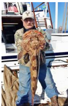
Some fish caught on a recent trip.

Local Rock cod closures begin Jan 1 to March 1 but we have offshore trips planned for those tasty fish. Please use a release system on the boats to get those little ones back down so they can grow up.