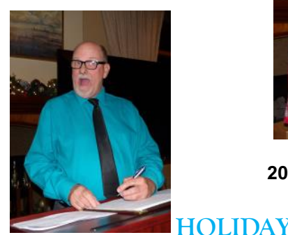
PARTY Our Master of Ceremonies