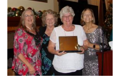
2018 Lady Angler of the Year