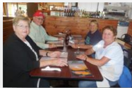
Dinner at the Lake Cuyamaca Cafe