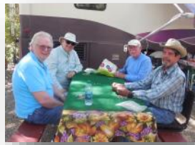
Cards and Crafts