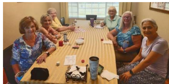
June's gathering. A lovely cool afternoon inside as we enjoyed playing and avoiding the heat.