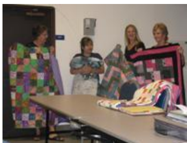
Quilts presented to "Mary's House".