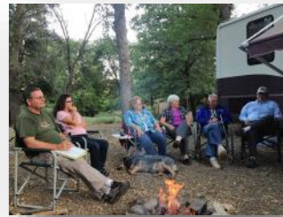
Around the Campfire