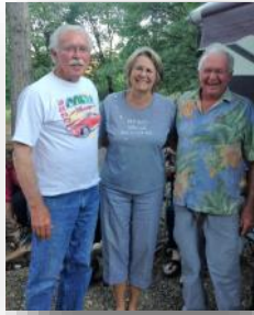
Wagon Master and his Assistants.

The fishing was good, no huge ones, but there were several limits. 75 total. Some of the limits were caught by 8:00 o'clock. Join us next year.