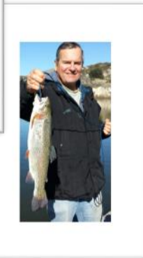
The Fishing Champs