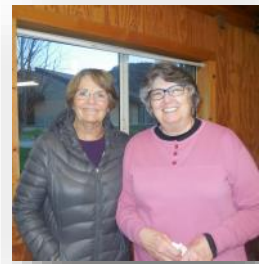
Washers Doubles and Singles Tournament Champs