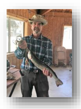
Keep smiling and fishing,