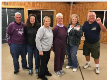
Card Bingo Winners