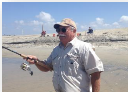
Doing What He Loved