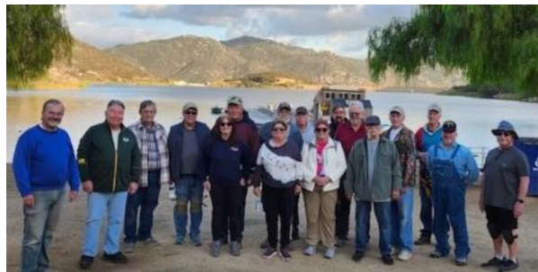
November Kiddy Pond Assembly

The Kiddy Pond assembly is scheduled for Monday, March 31st, at Dixon Lake from 3 to 5 pm (last time, it took only an hour).