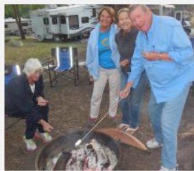
S'mores with various chocolate choices were a big hit.