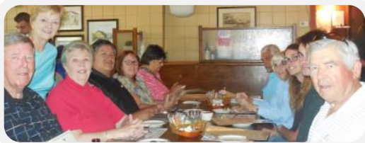
A "light" meal a Jockos.