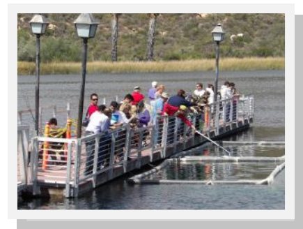
The Kiddy Pond