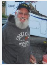
The Montague's and Purdue's provided a wonderful Pancake Breakfast