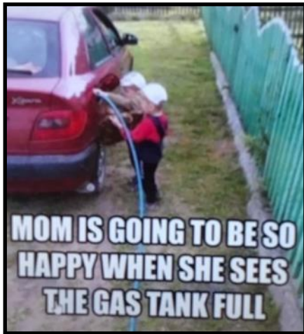
Submitted by Cheryl