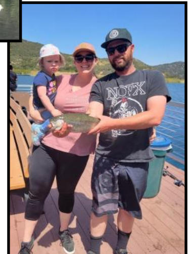
First Fish for a 2 Year Old