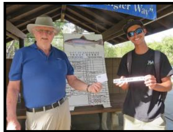
Some Happy Fishermen