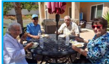
Enjoying the Day