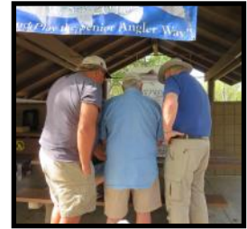
Some of our great Team