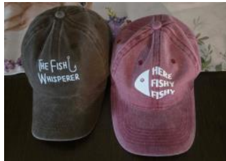
"Fish Whisperer" and "Here Fishy Fishy"