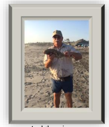
And the winner, so far.....