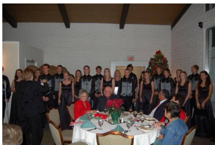
Faith Expression Group Choir from Calvin Christian School