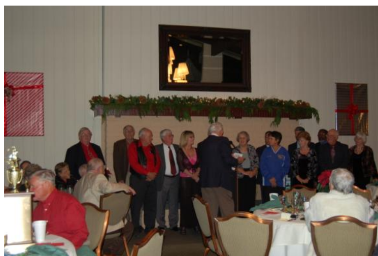
Swearing in of the 2011 Board Members